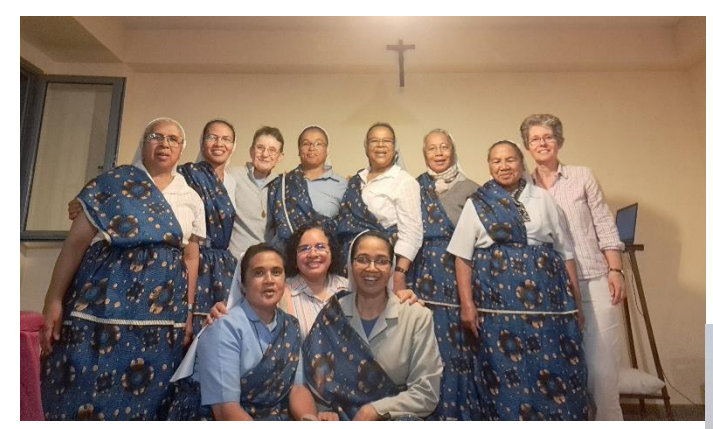
Feb 11: Meeting with the Finance Team